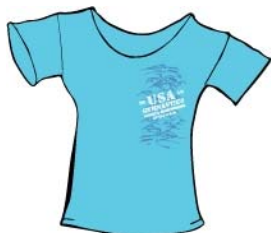
Ladies Fitted T-Shirt

(Turquoise T-Shirt with logo as shown above)